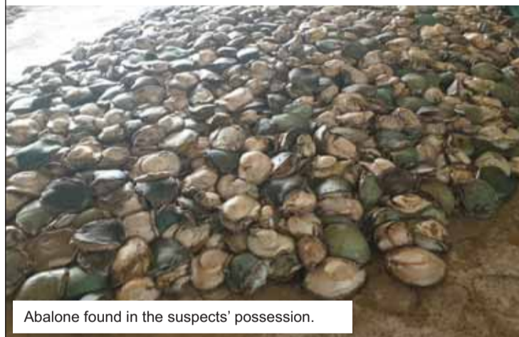
Abalone found in the suspects' possession.

Hekpoort/ Magaliesburg – On Monday 18 November, members of the West Rand Flying Squad acted on a tip-off about a suspicious truck traveling from Cape Town loaded with fresh abalone headed to a farm in Hekpoort near Magaliesburg.